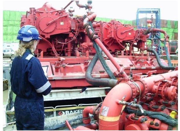
Environment Agency staff on site in November

We didn't record any non-compliances, but we have asked the operator to refine management procedures to ensure that information is recorded accurately, in line with the permit, before work starts.